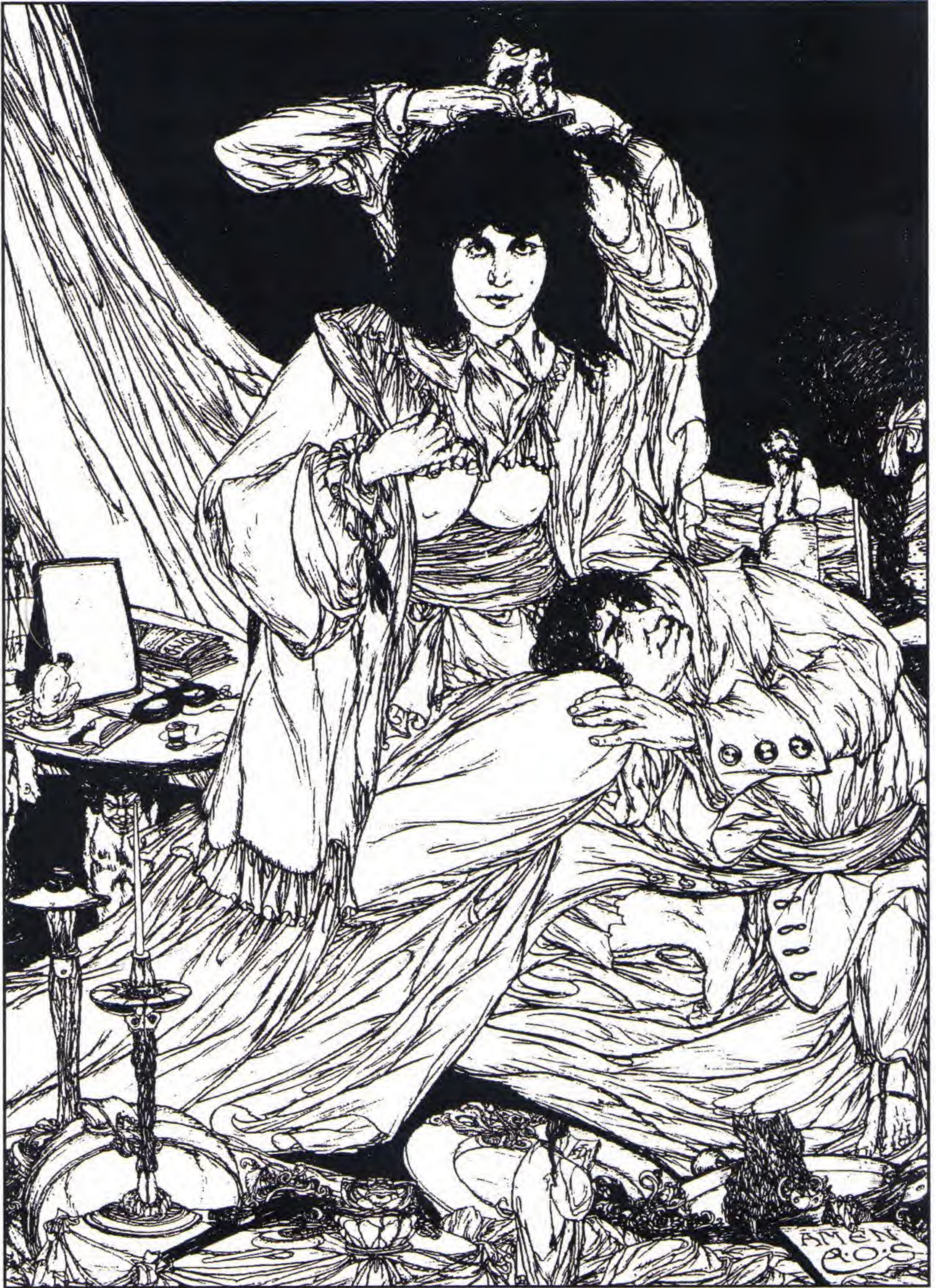
The Beauty Doctor